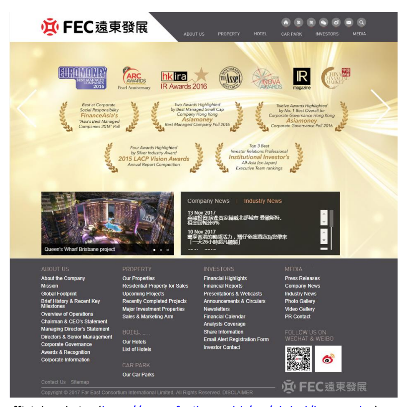
Photo caption: FEC's official website (<a href="http://www.fecil.com.hk/en/global/home.php">http://www.fecil.com.hk/en/global/home.php</a>)

Photo caption: FEC garnered the Bronze Award in the "Online Annual Report Category" and the "Corporate Website Category" in iNOVA Awards 2017