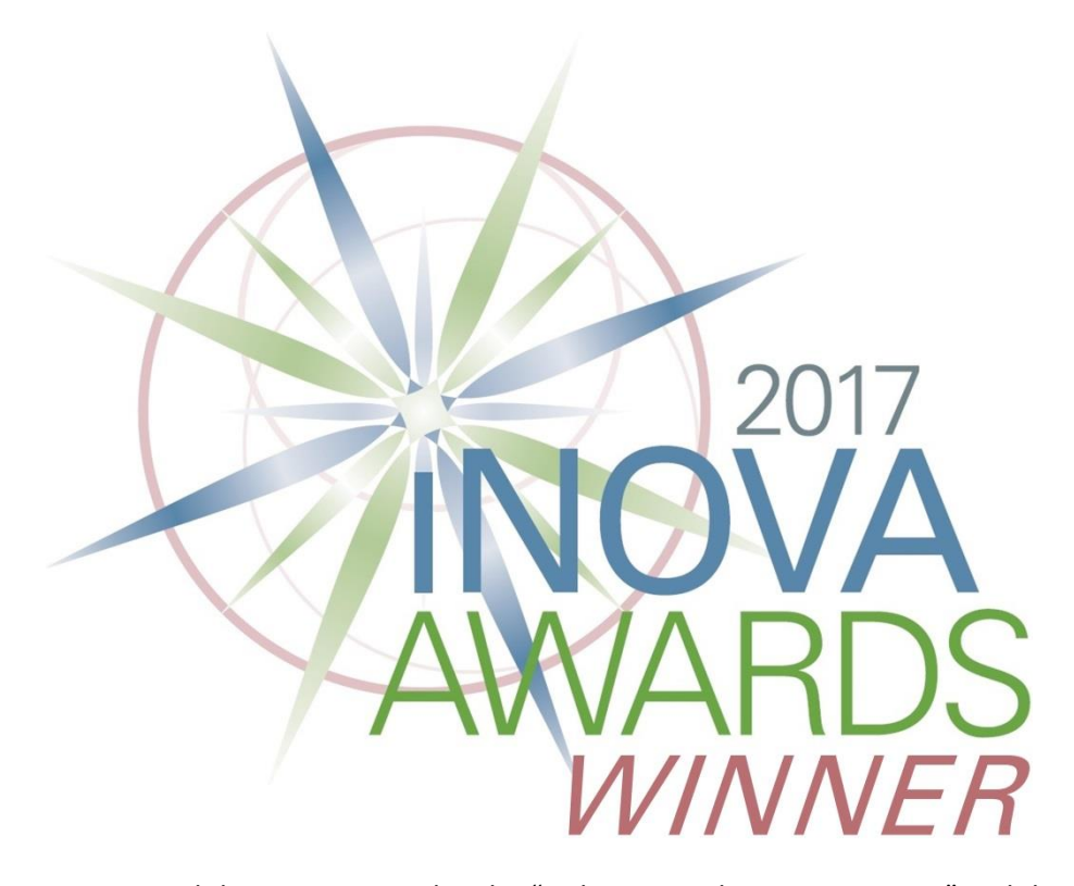
Photo caption: FEC garnered the Bronze Award in the "Online Annual Report Category" and the "Corporate Website Category" in iNOVA Awards 2017