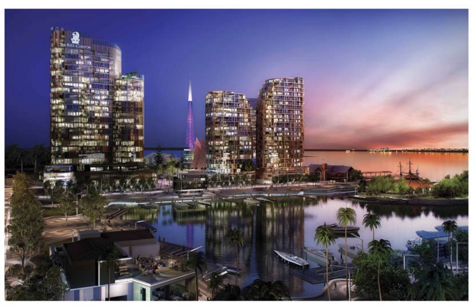
Elizabeth Quay Artist Impression - Eastern Promenade (view south east)