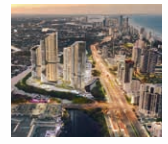
The Star Residences - Epsilon (Tower 2), Gold Coast launched