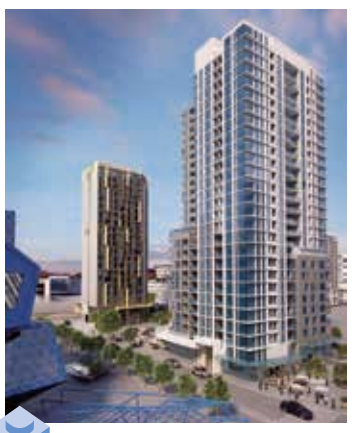
The Group was selected as a preferred proponent to develop Lots 3B, 6 and 7 of Perth City Link in Perth, Australia